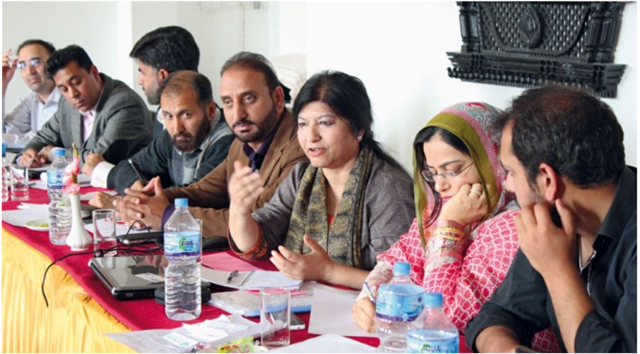
Conciliation Resources' partners from both India and Pakistan administered Kashmir meet to share analysis, lessons and insights from their work.